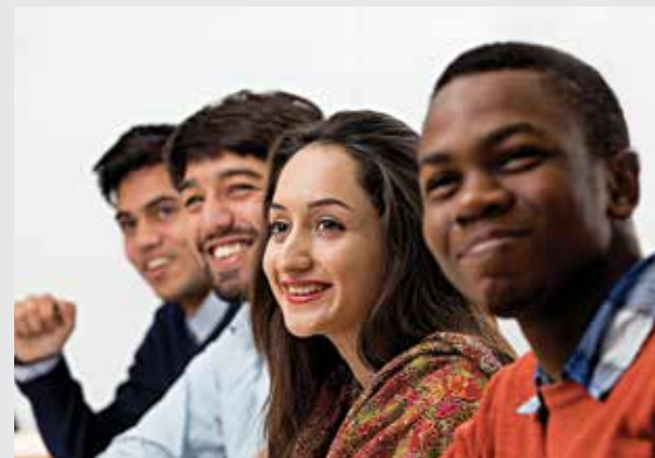
Students have to be either professionals in the respective field or a current undergraduate student with an intermediate level of English.

Tuition Fees £995 for a two week programme