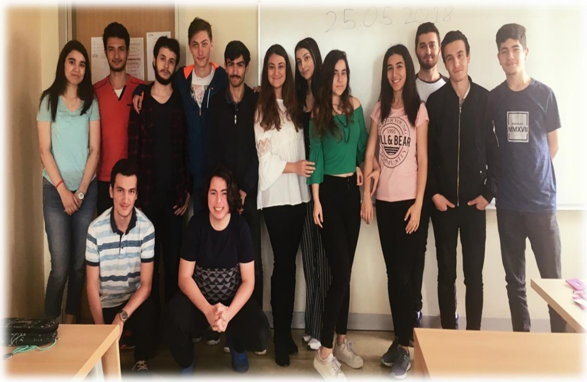
We were here after lesson