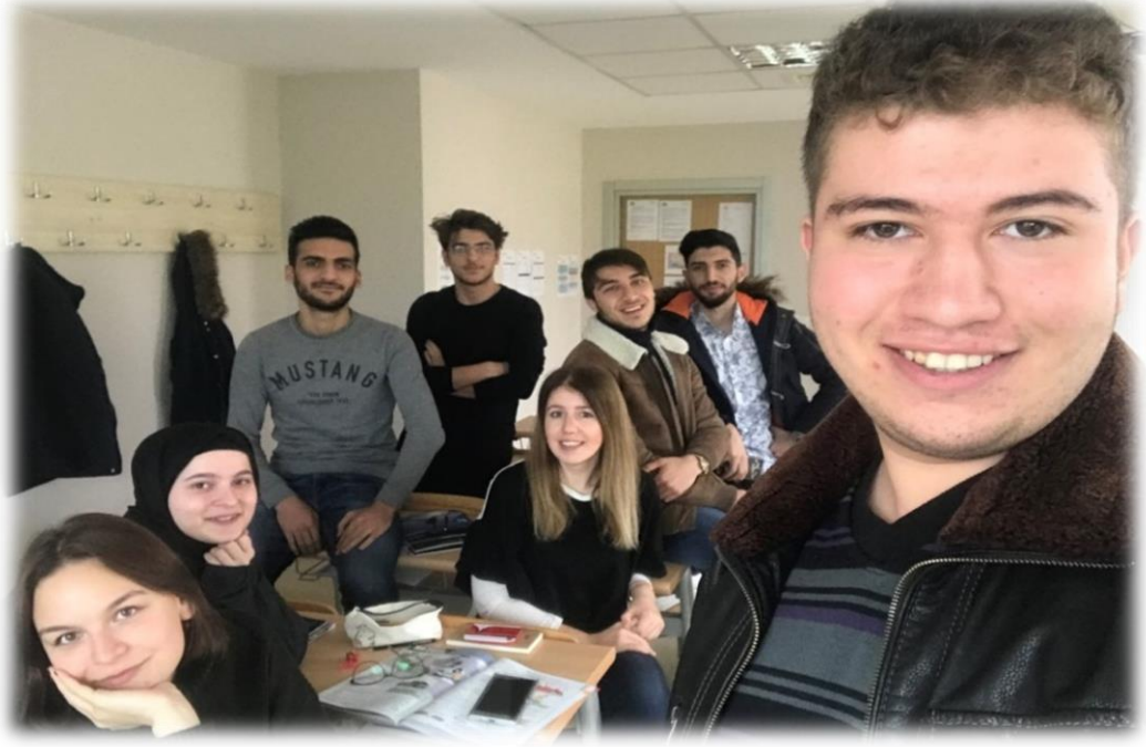
A pleasant moment with our English Preparatory Students after class