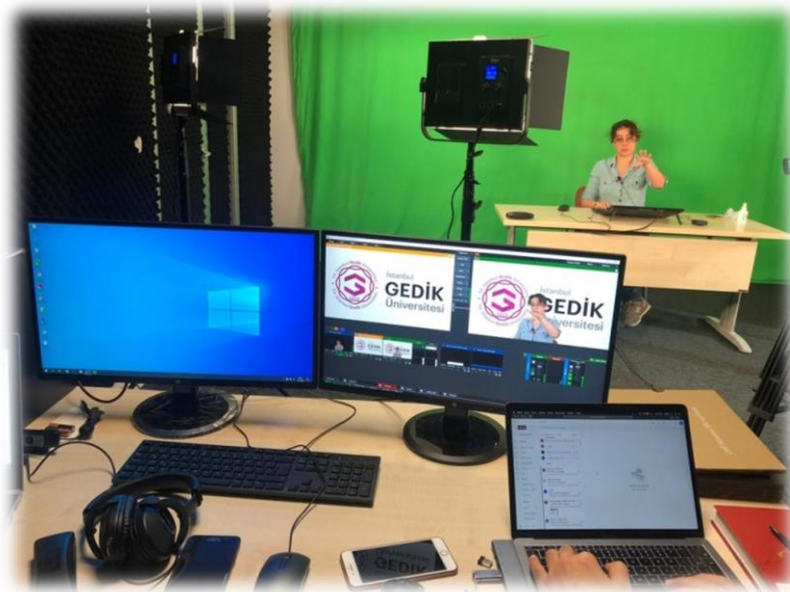
Background of Online Orientation

After informing about the English Preparatory Program, how you can attend a lesson in the distance education system, how to submit your homework, how to send a message to your teacher, briefly everything about the system will be explained by our teacher in charge of distance education. Participating in this orientation helps you understand the system.