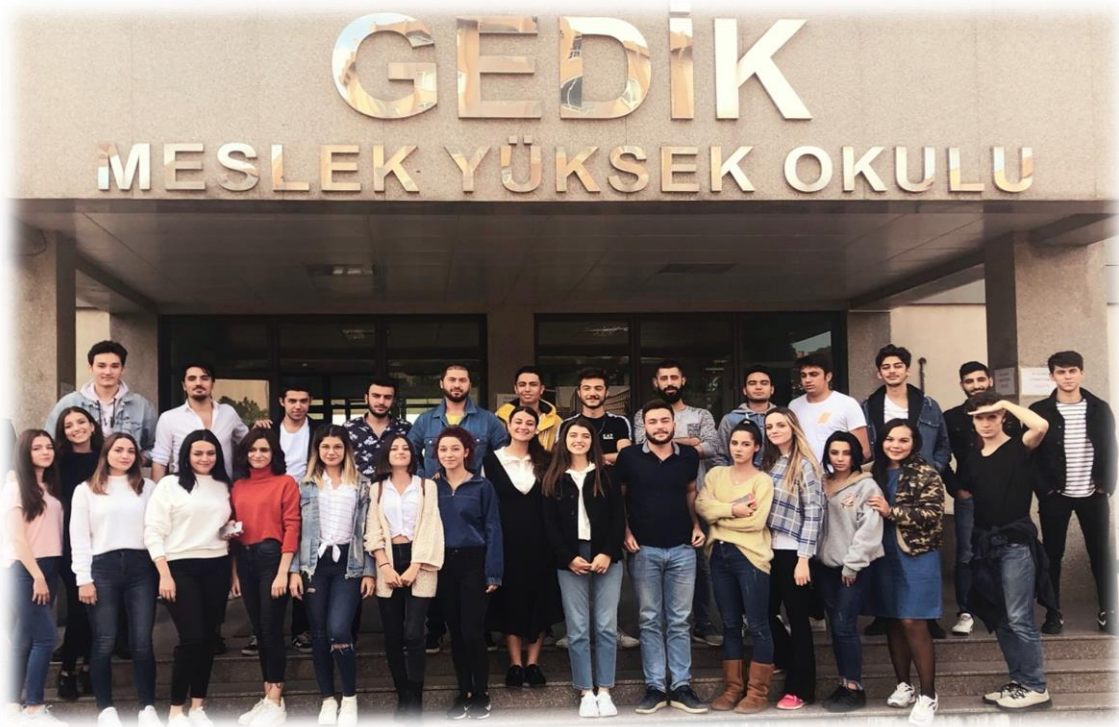
with our students of civil aviation and cabin services department after the lesson