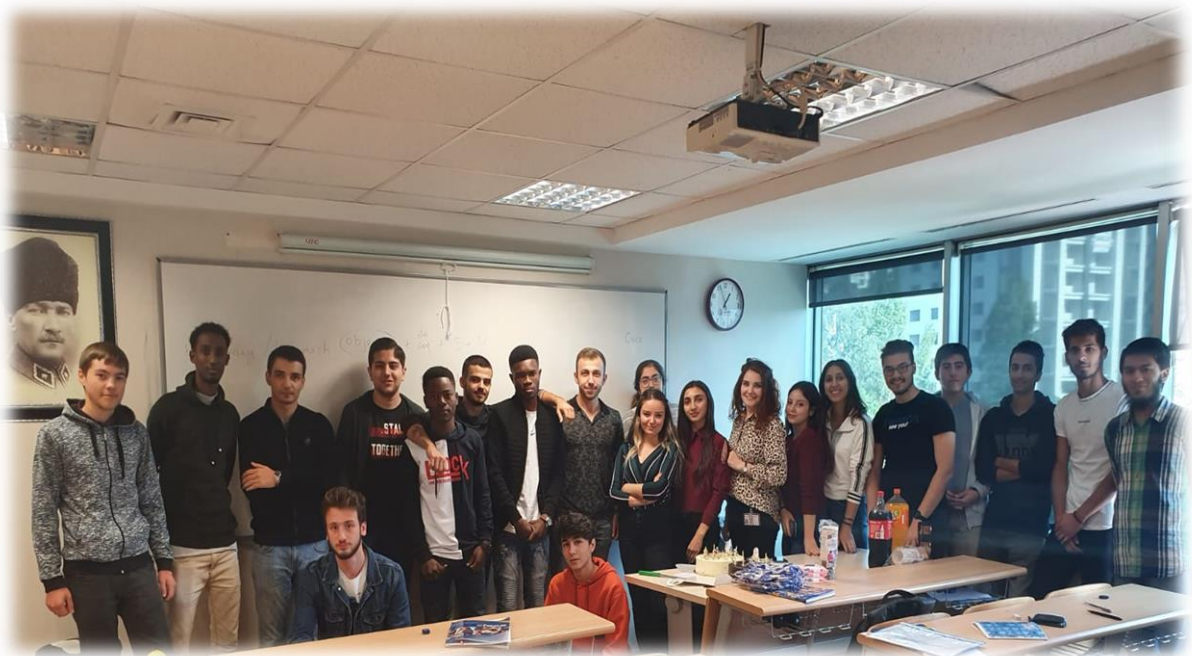
Celebration with our English Preparatory Students after class