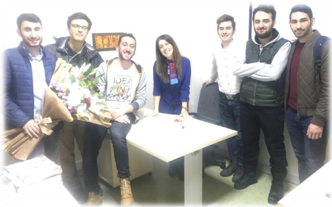
Our Tactful Students