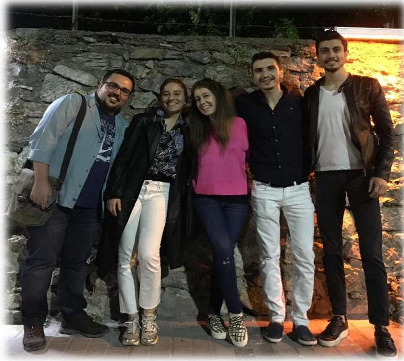
An evening outing with our International Relations students who took the ING402 course