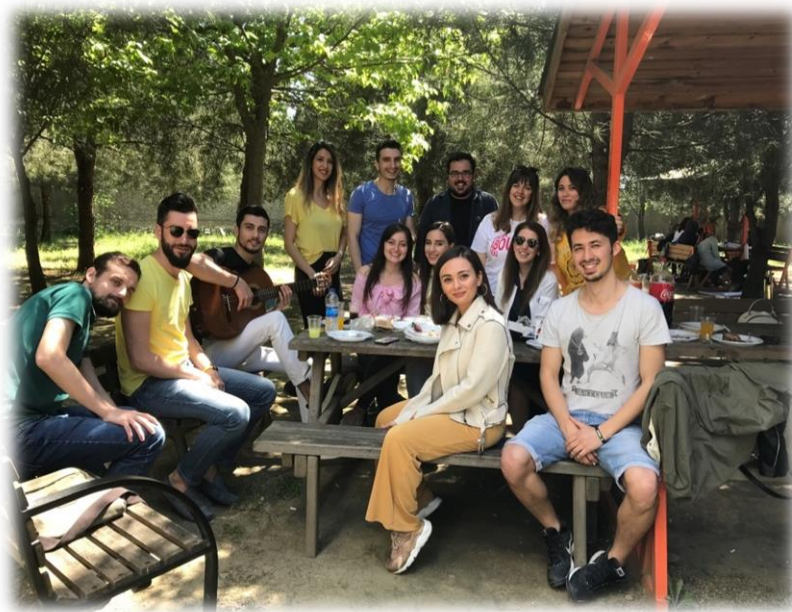
A moment with our International Relations department students who took the ING402 course