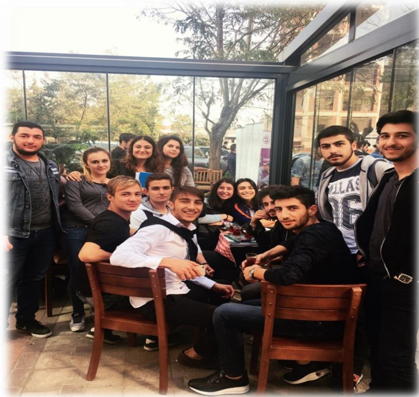
With our English Preparatory Students after class in the Winter Garden